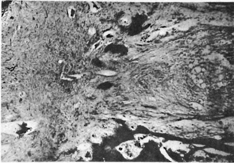
Fig. 1c : Neuroma formation is quite evident. Glees Silver stain \times 50