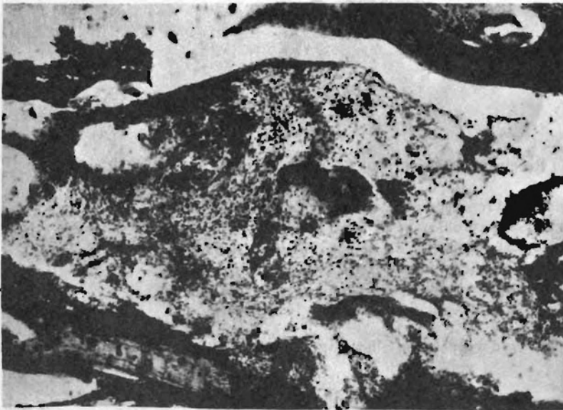
Fig. 1a : Fibrinoid necrosis with infiltration by neutrophils 48 hours following SCT. H and E stain \times 125

verified in 4 sections, where animals died 24 hours following transection. Nucleated red blood cells could